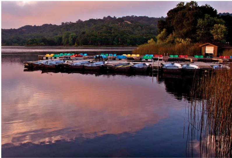
Sunrise at the Docks