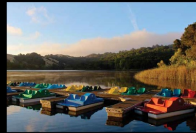
Fishing Pier and Dock