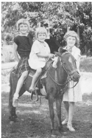
The 3 sisters, Seattle 1936

home. I made mud pies, decorated them, set them in the sun to dry, cut them into pieces and tried to eat them. That did not last long!